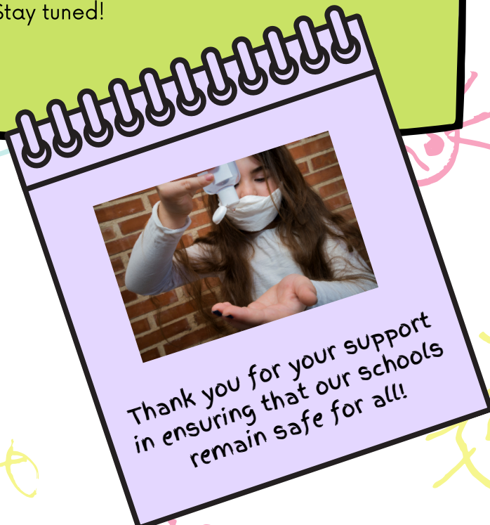
Thank you for your support in ensuring that our schools remain safe for all!