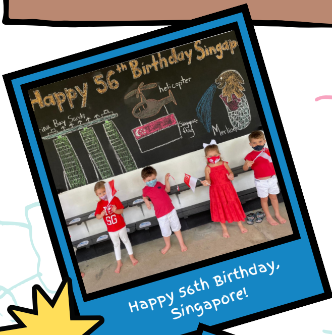
Happy 56th Birthday, Singapore!