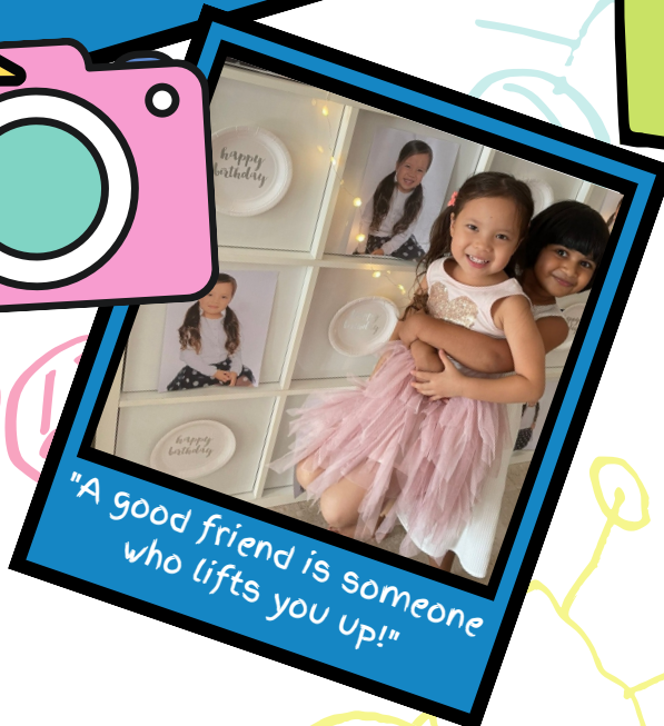
"A good friend is someone who lifts you up!"